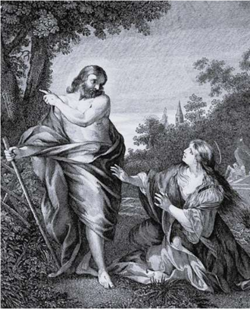
Christ appearing to Mary in the Garden Engraving by W. Walker, c. 1760, after P. da Cortona.