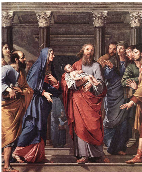
The Presentation of the Temple, Philippe de Champaigne (1602-1674)