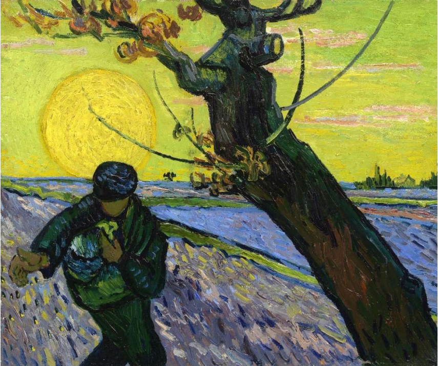
The Sower III (version 2), Vincent van Gogh (1853-1890)