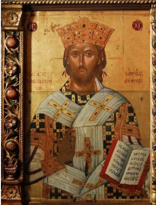
Christ, King of Kings and High Priest, unknown (c. 1500)