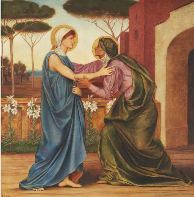
The Salutation , Evelyn De Morgan (1855-1919)