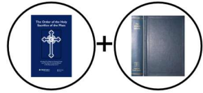
Mass Booklet Hymn Book

We are an Anglo-Catholic Parish in the Diocese of Ottawa, celebrating 135 years of worship and service: 1889-2024.