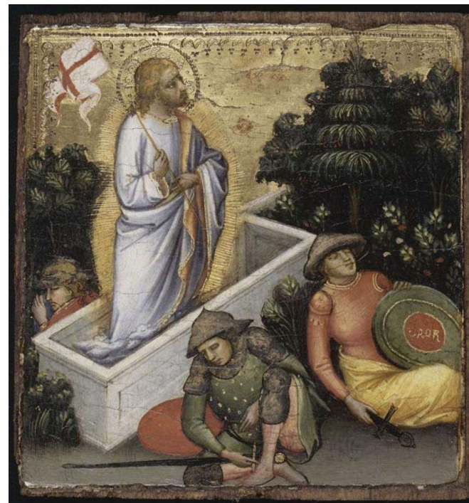
Resurrection, Mariotto di Nardo (c.1395)