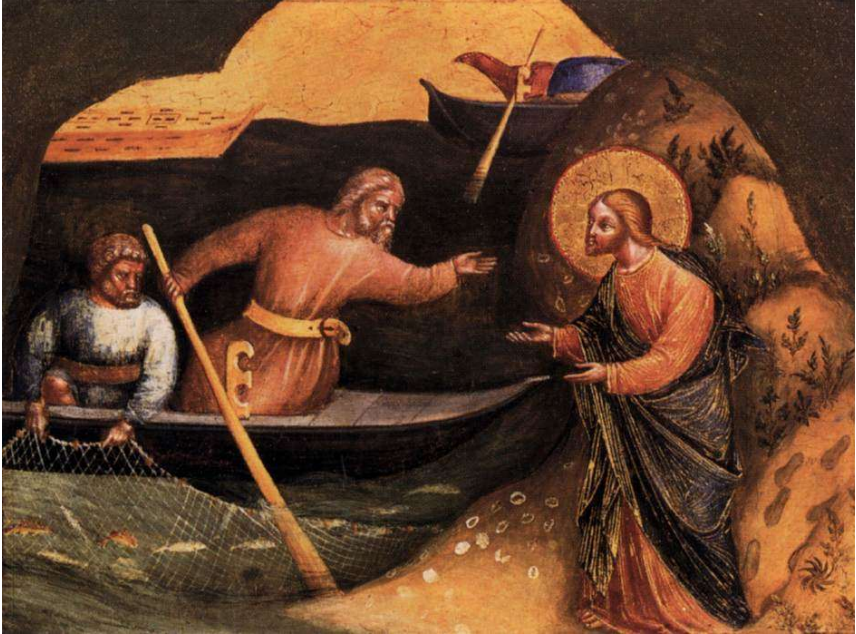
Calling of the Apostles Peter and Andrew, Lorenzo Veneziano (c.1370)