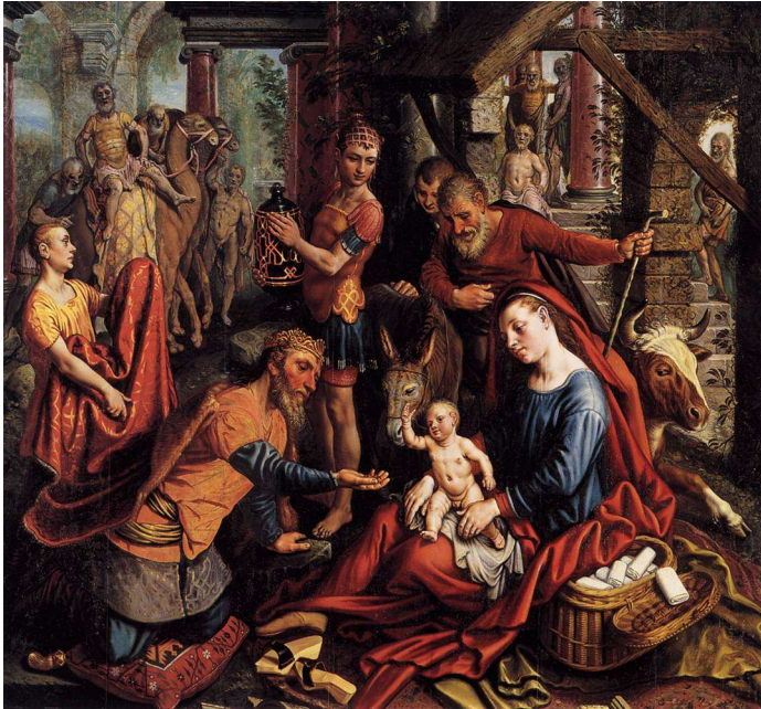
Triptych with the Adoration of the Magi (central panel), Pieter Aertsen (1508-1575)