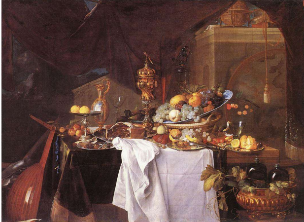
A Table of Desserts, Jan Davidsz. de Heem (1606-1684)