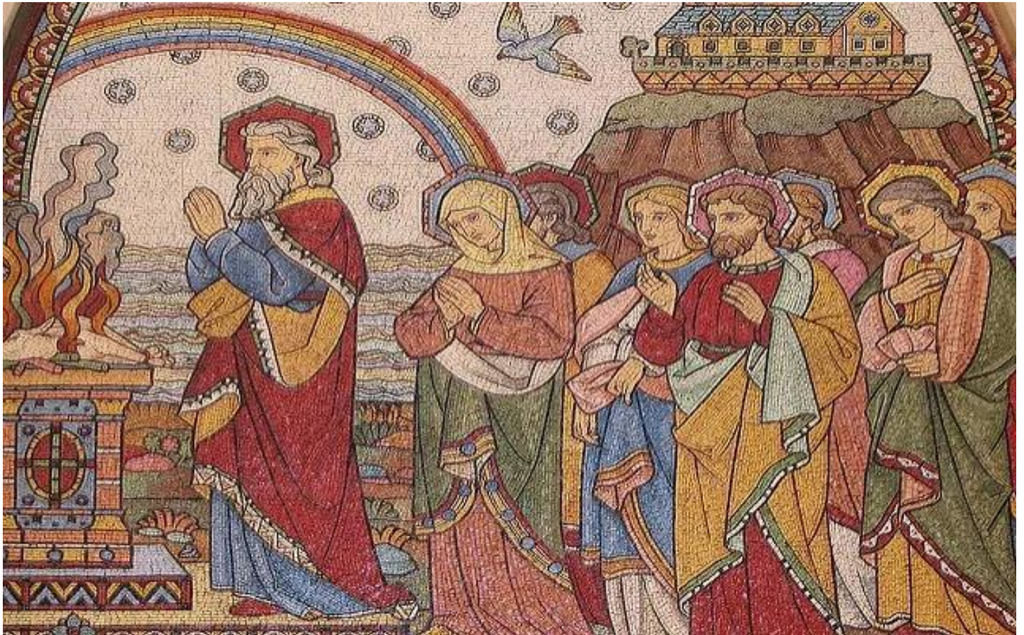
Noah offering sacrifice, (mosaic, Keble College, Oxford), William Butterfield (1814-1900)