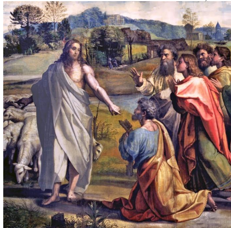
Detail from "Christ's Charge to Peter" (1515/16) – Raphael (1483-1516)

THE ANGLO-CATHOLIC PARISH IN THE DIOCESE OF OTTAWA CELEBRATING 130 YEARS OF WORSHIP AND SERVICE, 1889-2019