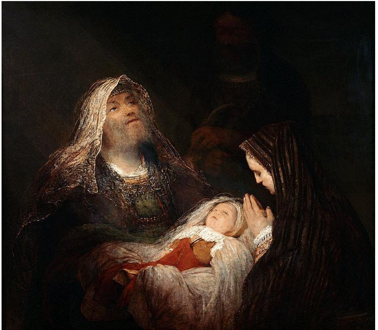
Simeon's song of praise, Arent de Gelder (1645-1727)