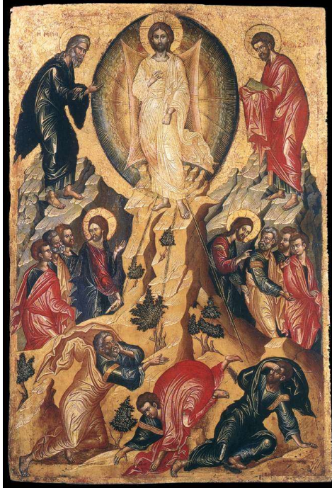
The Transfiguration of Christ (c.1550)