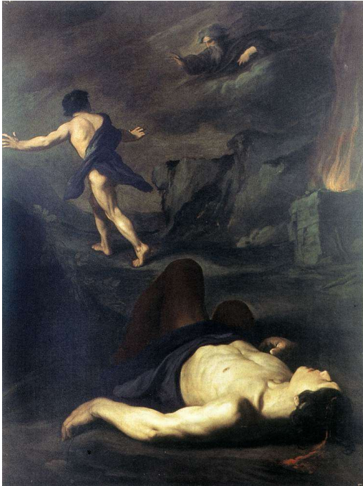
Cain and Abel , Pietro Novelli (1603-1647)