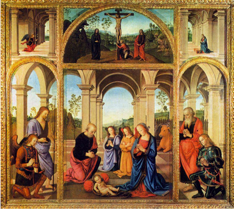
Polyptych Albani Torlonia, Pietro Perugino (1450-1523)