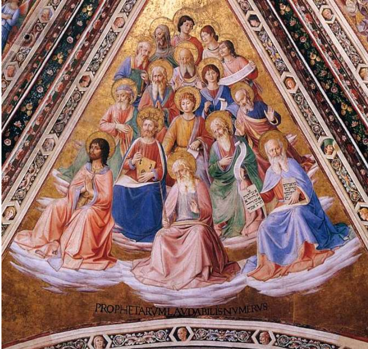
Prophets, Fra Angelico (c.1400-1455)