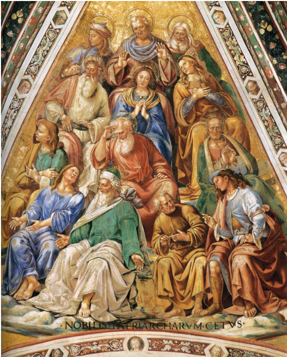
Choir of Patriarchs, Luca Signorelli (c.1450-1523)