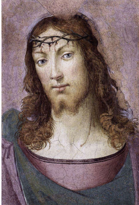
Christ Crowned with Thorns, Fra Bartolomeo (1472-1517)