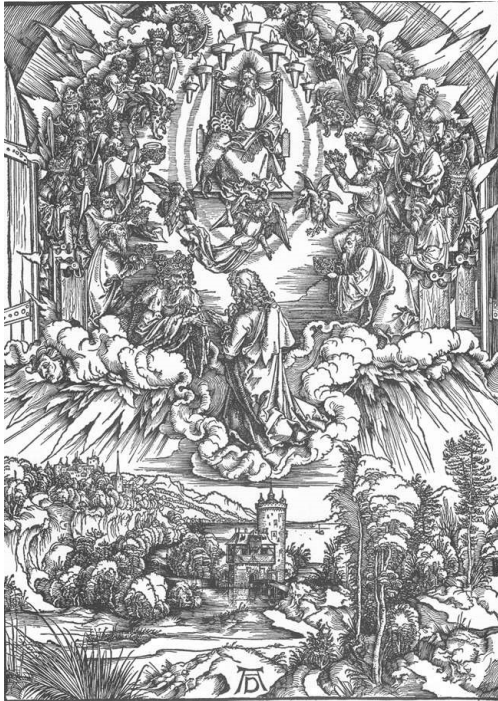
The Revelation of St John: 3. St John and the Twenty-four Elders in Heaven, Albrecht Dürer (1471-1528)

Mass Booklet Hymn Book and the Book of Common Prayer (BCP)