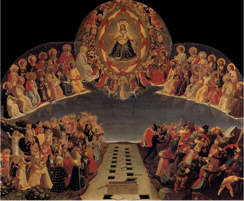
Last Judgment, Fra Angelico (c.1400-1455)