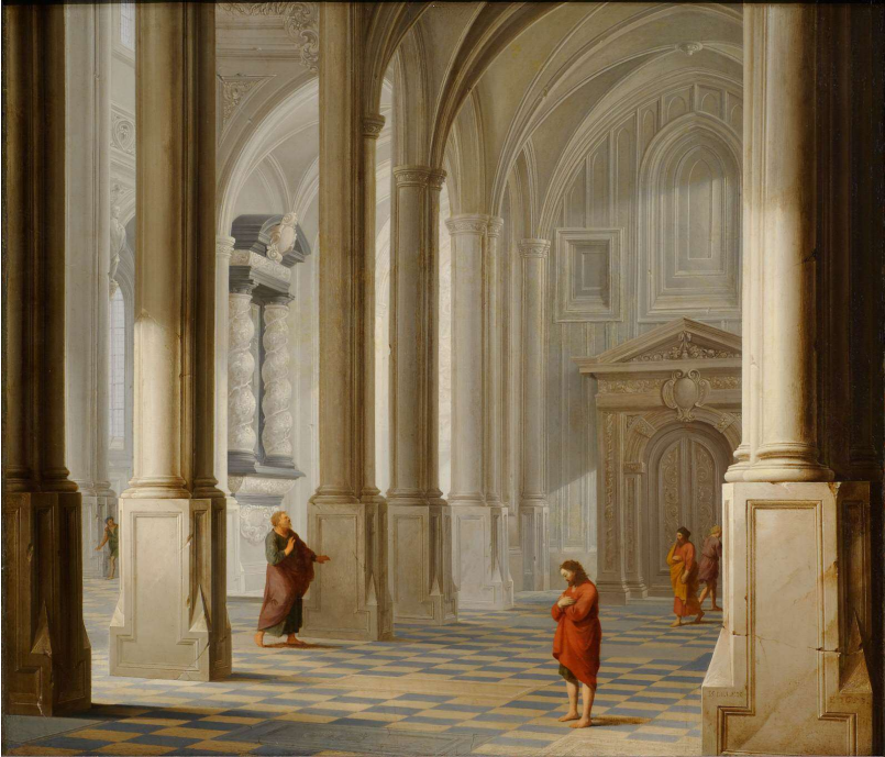
Church Interior with the Parable of the Pharisee and the Publican, Dirck van Delen (c.1604-1671)