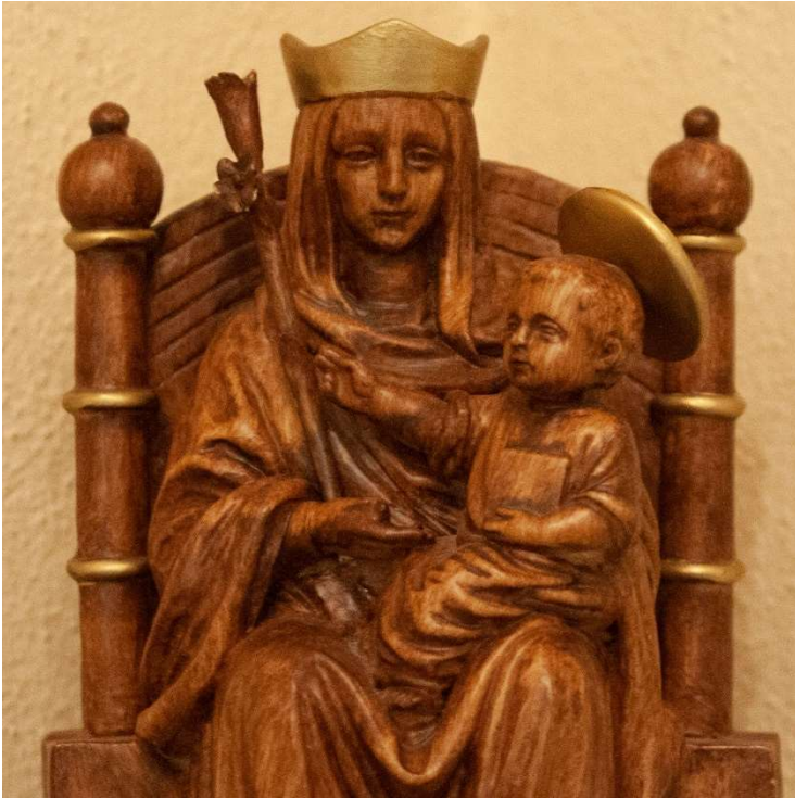
Our Lady of Walsingham

Mass Booklet Hymn Book and the Book of Common Prayer (BCP)