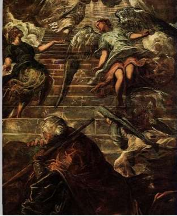
Jacob's Ladder (detail), Tintoretto (1518-1594)