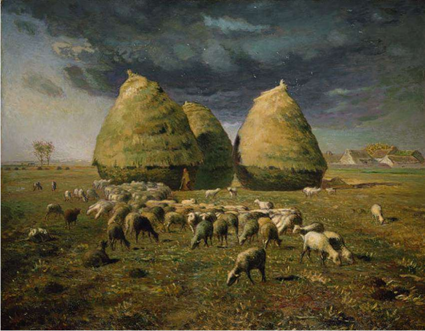
Haystacks: Autumn , Jean-François Millet (1814-1875)