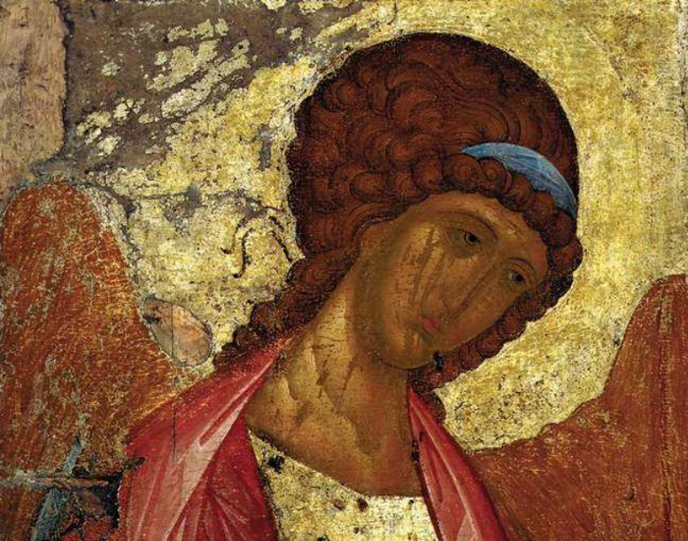
Deesis Range: The Archangel Michael (detail), Andrey Rublyov (c.1360-1430)