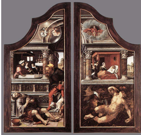
Triptych of Virtue of Patience (closed), Bernaert van Orley (c.1491-1542)