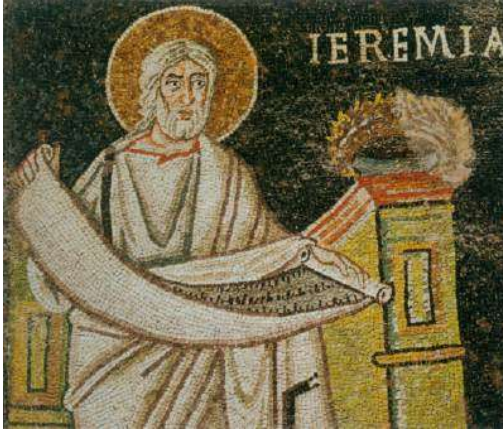
Prophet Jeremiah, Byzantine mosaic