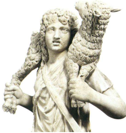
Good Shepherd (detail), 4 th century Italian