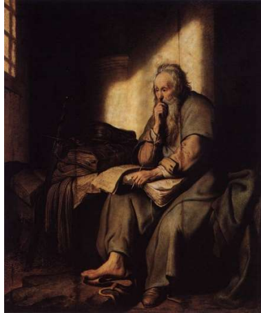
Apostle Paul in Prison, Rembrandt (1606-1669)