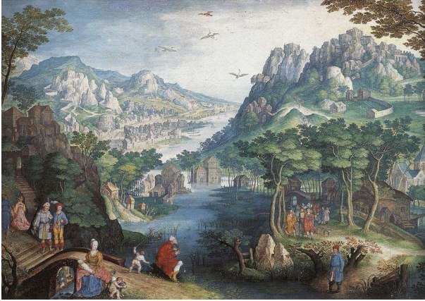
Mountain Landscape with River Valley and the Prophet Hosea, Gillis van Coninxloo (1544-1607)