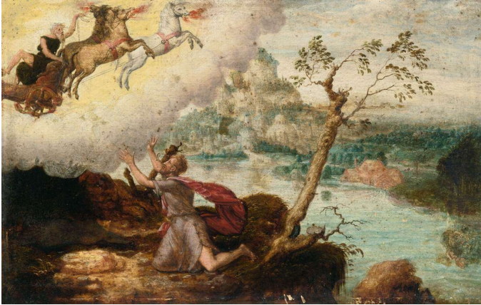
Elijah Ascending to Heaven in the Fiery Chariot, Herri met de Bles (c.1510-c.1550)