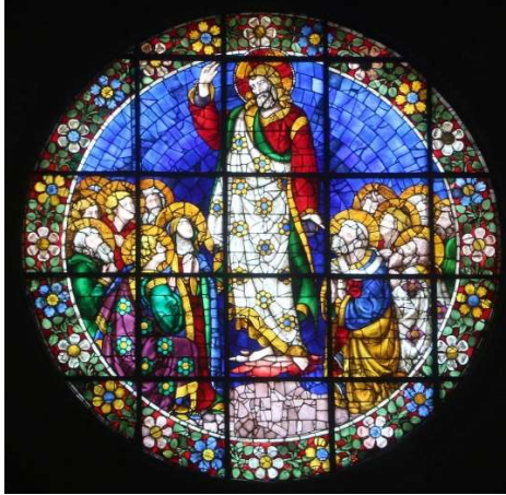
Ascension , Lorenzo Ghiberti (1378-1455)