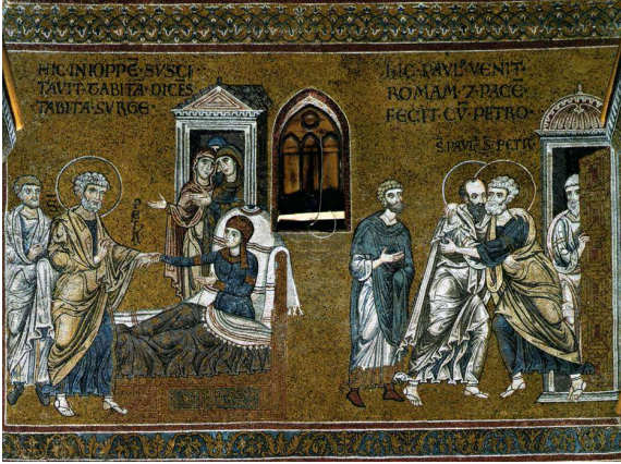
Raising of Tabitha and Meeting of Peter and Paul, Italian Mosaic Artist, Monreale (c.1180)