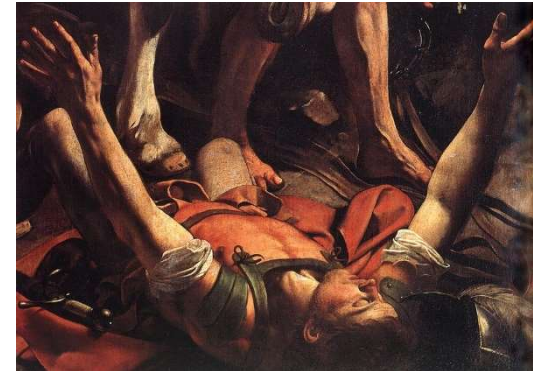
The Conversion on the Way to Damascus (detail), Caravaggio (1571-1610)