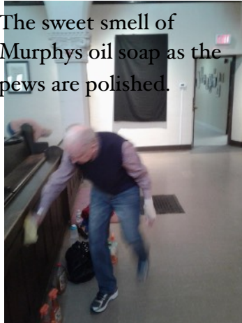
The sweet smell of Murphys oil soap as the pews are polished.