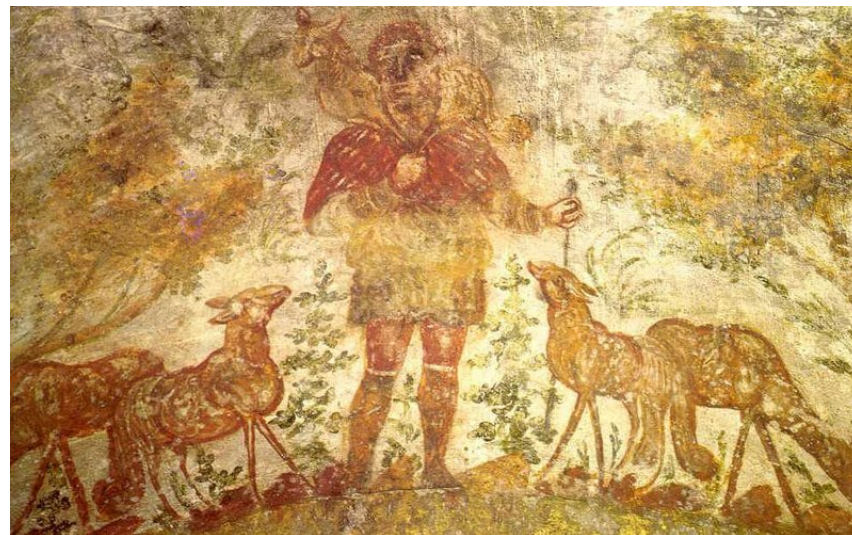
Christ the Good Shepherd, 3 rd century – Catacomb of Domatilla, Rome

THE ANGLO-CATHOLIC PARISH IN THE DIOCESE OF OTTAWA CELEBRATING 130 YEARS OF WORSHIP AND SERVICE, 1889-2019